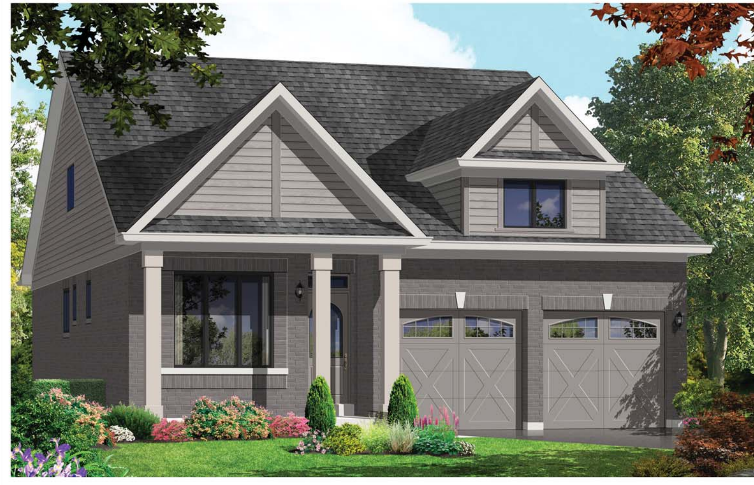
Elevation - A - 2486 sq.ft.