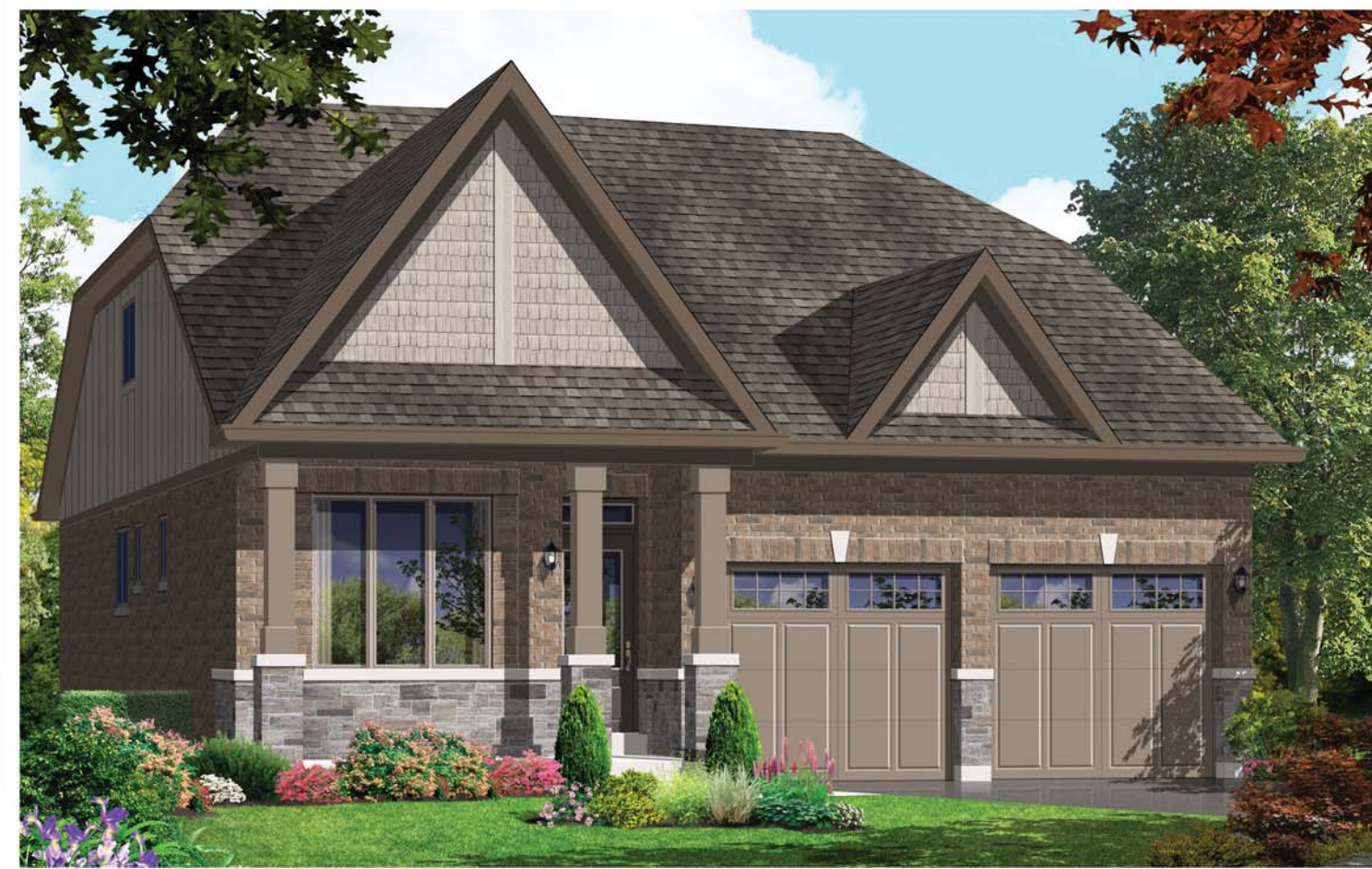
Elevation - C - 2486 sq.ft.