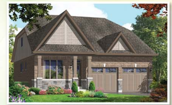
ELEV - C - 2486 sq.ft.