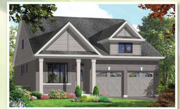
ELEV - A - 2486 sq.ft.