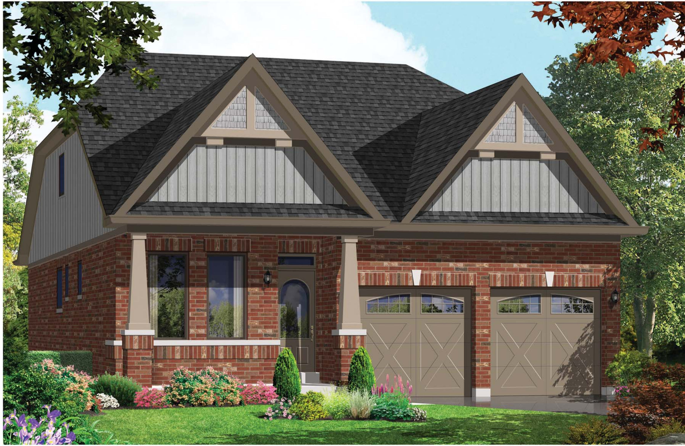
Elevation - B - 2486sq.ft.