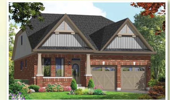
ELEV - B - 2486 sq.ft.